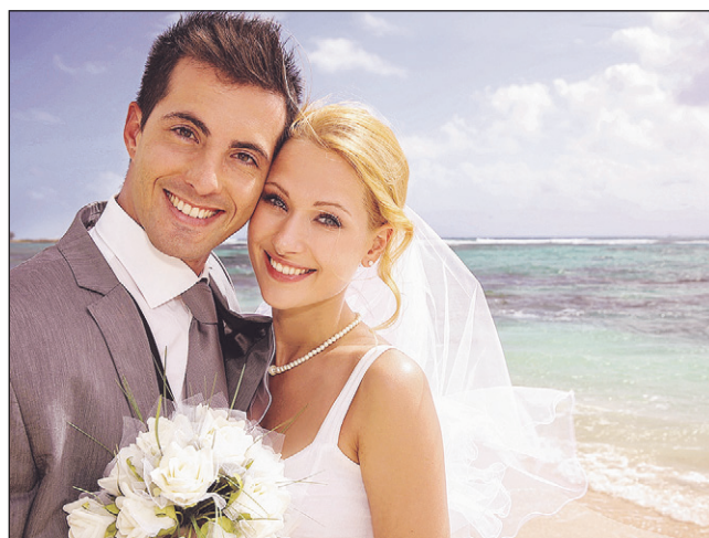
3.34" wide & 2.5" tall Black & White: $30 Color: $40