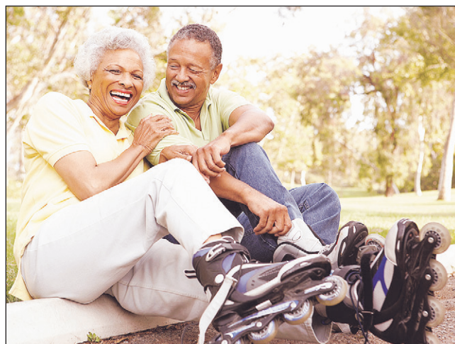
3.34" wide & 2.5" tall Black & White: $30 Color: $40